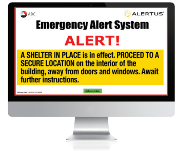
Alertus Desktop™ Notification can deliver a facility-wide emergency notification in a matter of seconds.